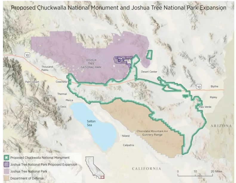
Chuckwalla National Monument (outlined in green), ABDSP's new neighbor in the Colorado Desert

After several years of garnering support from many constituencies, and working hard to gather data as well as political support, a coalition of Native American tribes and organizations, environmental organizations, politicians, and federal agencies focused on the Colorado Desert celebrated the creation of Chuckwalla National Monument on January 7, 2025. The new monument was designated by President Joe Biden using his powers under the 1906 Antiquities Act. Incorporating nearly 644,000 acres, Chuckwalla National Monument will increase the level of protection of both natural and cultural resources in the Colorado Desert. It will also prevent the expansion of large renewable energy projects into the area south of the I-10 Freeway. Areas north of the Freeway already have many very large solar-energy projects that are within the Desert Renewable Energy Conservation Plan focus area (DRECP), designated by the federal government.