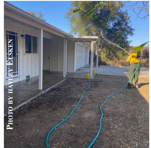
Angeles District employee rewetting gel on state park building during the Palisades Fire.