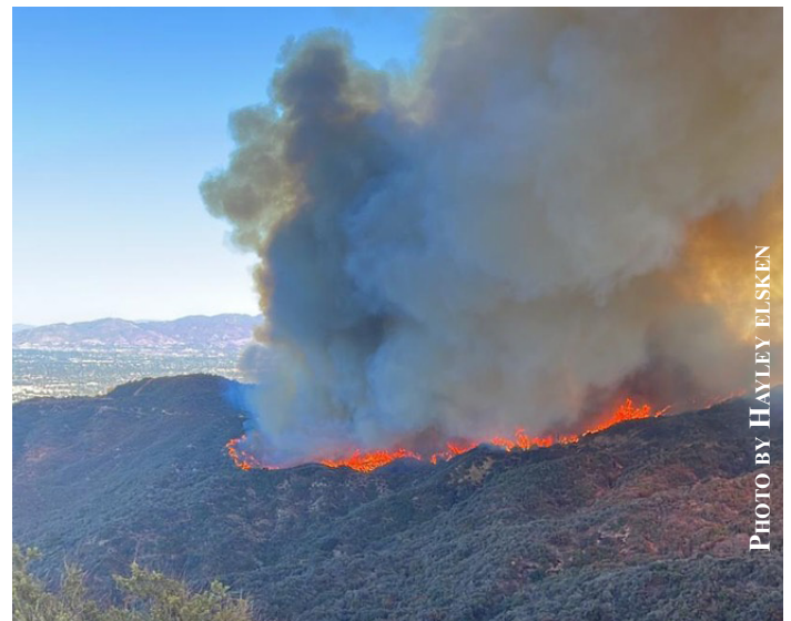
The Palisades Fire burning in Topanga State Park