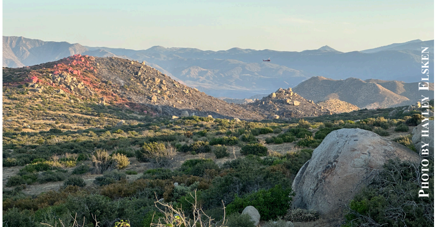
Water helicopter circling over the Wilson Fire in Anza-Borrego Desert State Park

Over the summer, the Park has had a couple close calls with wildfires. One fire at Palomar Mountain State Park was less than an acre and another fire in Anza-Borrego Desert State Park was 20 acres. CalFire has done a spectacular job with fire suppression and working with the Park to avoid use of heavy equipment when safe to do so. The Park also prepared Resource Advisors (READs) for the possibility of the Bonny Fire near Anza moving into Anza-Borrego Desert State Park. READs assist firefighters in avoiding cultural, natural, and facility resources while completing their objectives on the fire. READs also help with the repair of any damage done during firefighting, like the repair of handlines. These small events have allowed the State Park READ team to feel very prepared if a larger deployment comes.