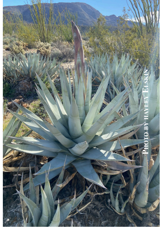
Spring comes to the desert