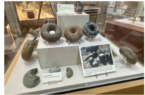
“Donut stone” display at the SDAC museum