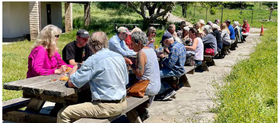
Attendees enjoyed a tasty lunch alfresco at the San Diego Archaeological Center.