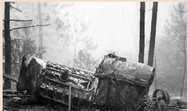
The remains of the DH4B were found just below and east of Japacha Peak. May 1923.