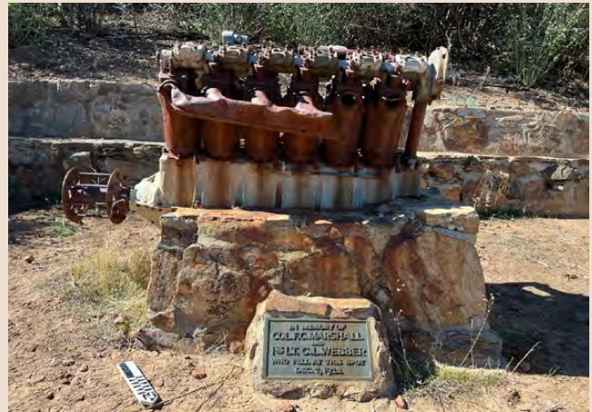
Current Airplane Crash Monument.

To register, please visit: https://www.anzaborregoarchaeo.org/airplane-crash/