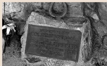
Bronze Dedication Plaque, Airplane Crash Monument.