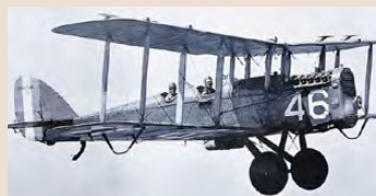
Example of the DH4B aircraft.