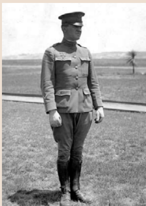
Major Henry H. "Hap" Arnold, Rockwell Field's Commander.