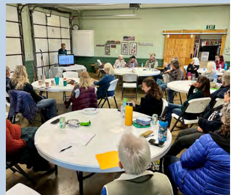
A splendid turnout