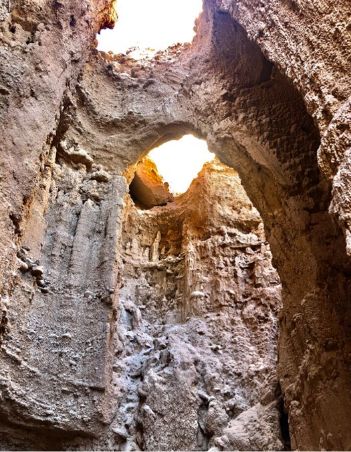
Dramatic rock formations near Font's Point