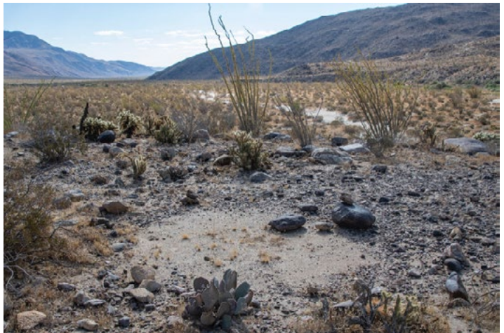
Traces of a rock circle at Ocotillo Flats

The Barnes completed the Archeology Technician class in 2018 and began stewarding sites in Sheep Canyon and Ocotillo Flats the following spring. These sites are accessible to hikers and campers, just off the main road through Coyote Canyon, but Barbara says the features in each area have endured. She and her husband look forward to seeing if there are still discoveries to be made “even on those beaten paths!”