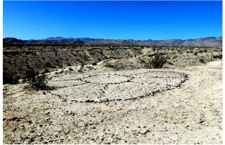
Native American medicine wheel