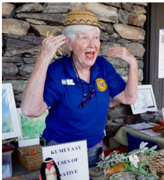
"...And it can also be a hat!"