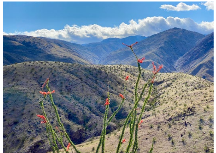
Ridgeline ocotillos in bloom