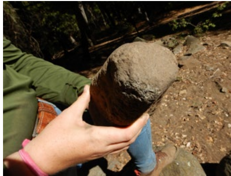
Close-up of the battered end of hand tool at village site in Palomar