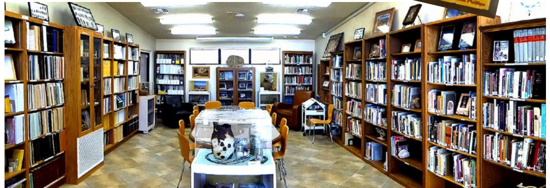
A wide-angled look inside the BARC Library