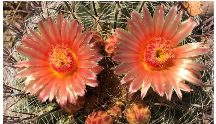
Fall cactus flowers