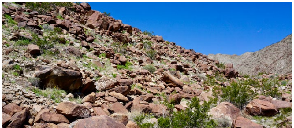
Views of Clark Dry Lake and surrounding area