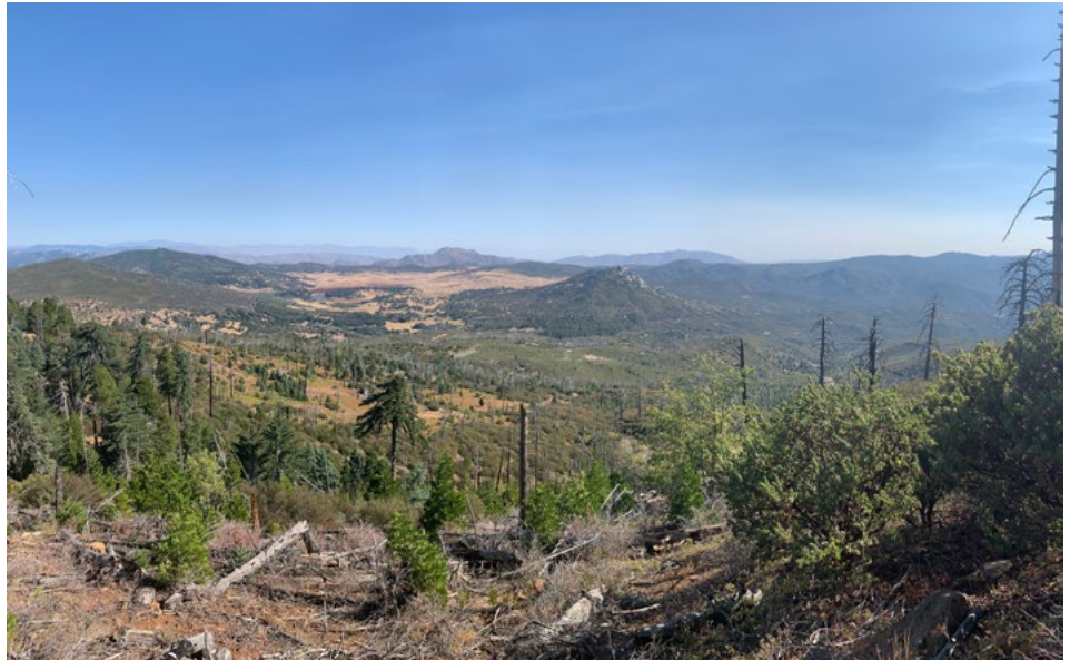
Spectacular view from the top of Burnt Pine Trail in Cuyamaca