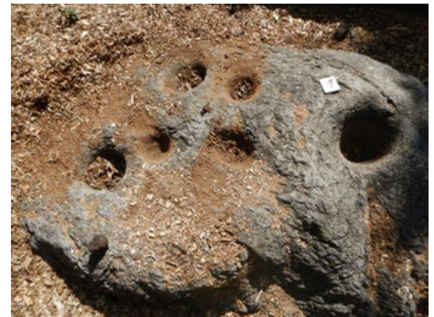
Large bedrock milling feature with multiple mortars at village site in Palomar