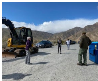
Social distancing was strictly observed in the classroom and outside at all times.

With all the digging and heavy equipment on the site, it is possible that features or artifacts may be uncovered. To ensure those areas remain undisturbed, construction may be halted until an evaluation of the findings is completed.