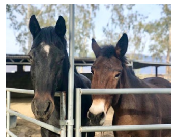
“Trooper” the horse and “Honey” the mule