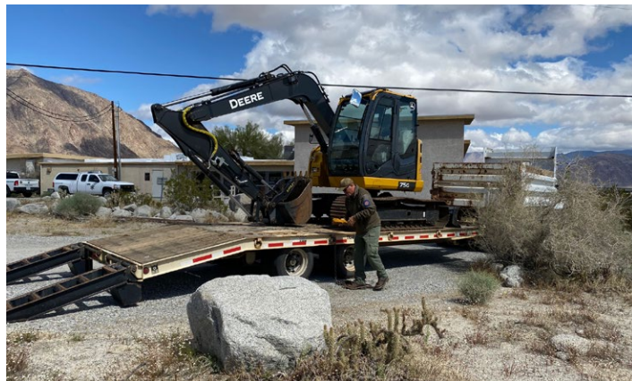
Above: State Park heavy equipment operator Adam Asche unloads the track excavator at the BARC to demonstrate how the machine is used at construction and utility-digging sites.