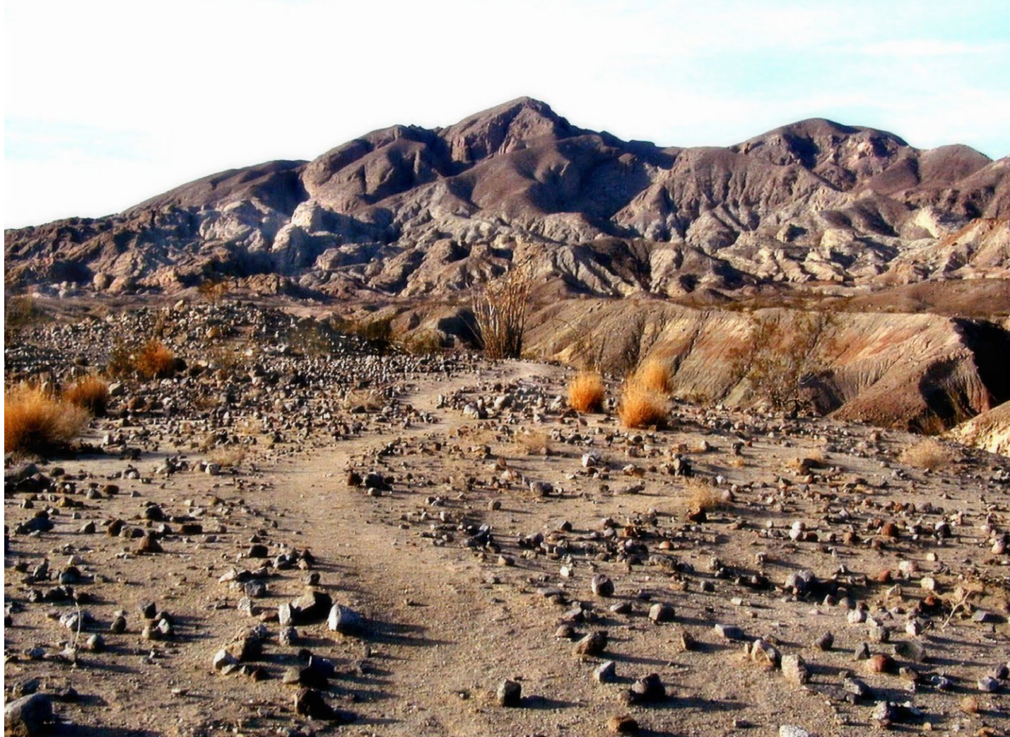
Ancient Indian Trail in the Santa Rosa Mountains