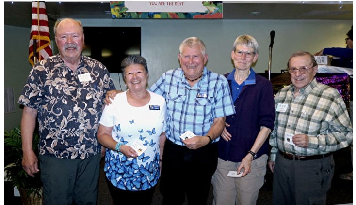
Emerald Pin recipients (1,000+ hours)