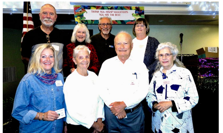
Sapphire Pin recipients (250+ hours)