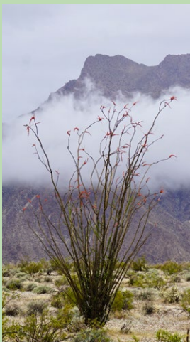
Ocotillo in the rain