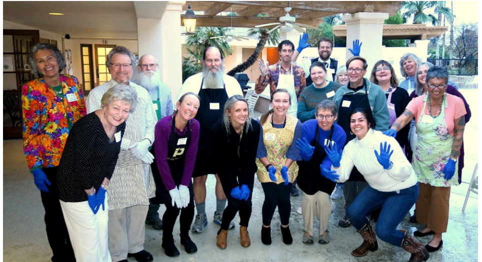
ABDSP staff get ready to serve dinner at the Volunteer Awards Gala.