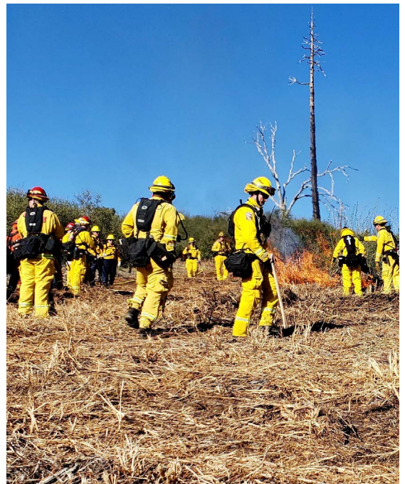
Firefighters executing a prescribed burn at Cuyamaca Peak along Lookout Fire Road

CDAS ANNUAL MEETING / DESERT POTLUCK Sunday, Jan. 26 • 12:30 to 3 p.m.