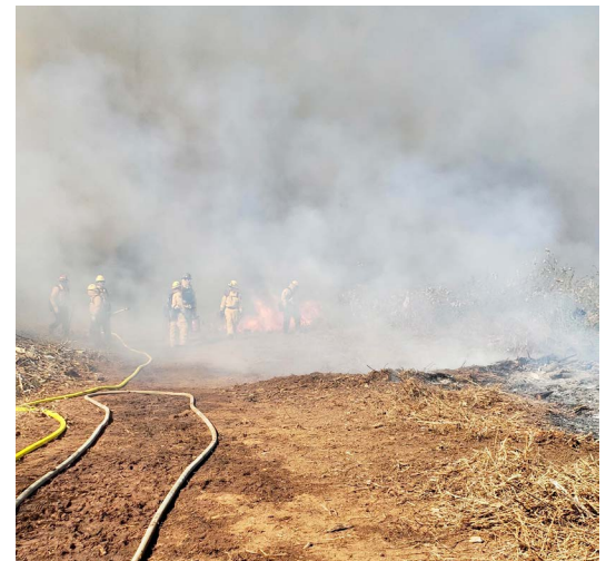
Heavy smoke makes the job increasingly difficult.

Thank all of you wonderful volunteers for what you do for our Parks. It takes a special