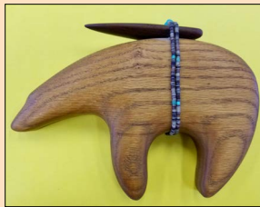
Wood bear with turquoise beads by Chuck Bennett