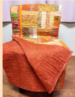
Handmade lap quilt