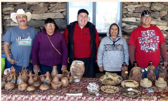
Members of the PaiPai people from Baja at the 2019 Archaeology Weekend

Click here for the full schedule of AW events: http://anzaborregoarchaeo.org/archaeology-weekend/