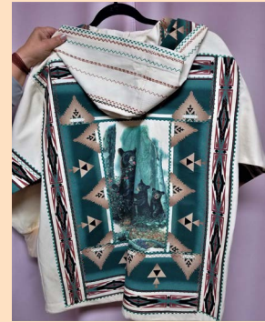
Great Bear Spirit-inspired woman's jacket