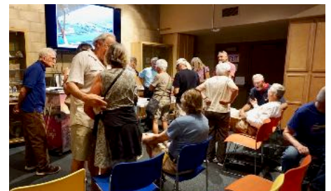
Audience members lingered after the lecture to ask questions, review copies of Anne's book and to catch up with friends.

The process is based on the theory that subsurface rocks would only begin to be coated in desert varnish after being unearthed during the building of a geoglyph.