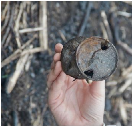
A historic artifact