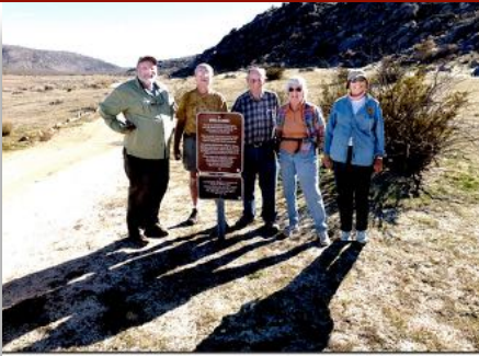
Colorado Desert Archeology Society volunteers installing Little Blair Valley Cultural Preserve signs - Jan. 10, 2012