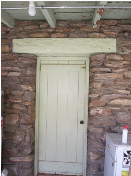
Rear original door on back porch of Caretakers Residence