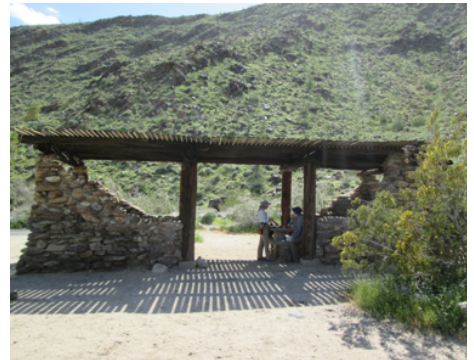
Stone Ramada Campsite 116

I'm very pleased that I've been invited to speak at the 2019 Desert Conference in Zzyzx. I'm sure you're all familiar with Zzyzx. The spelling alone would be enough to avoid it!