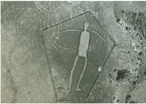
Human figure geoglyph near Blythe, California