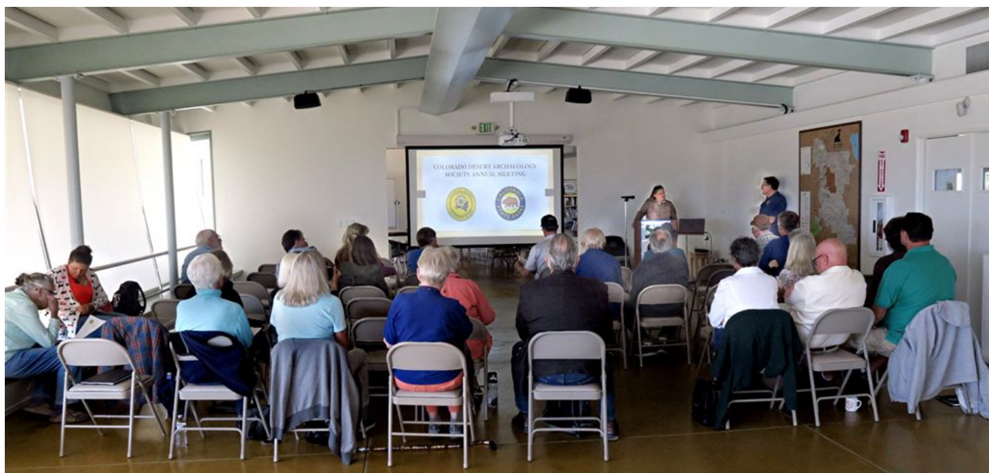
The CDAS annual meeting was held at the UCI Steele/Burnand Anza Borrego Desert Research Center, a classic example of Mid-Century architecture.