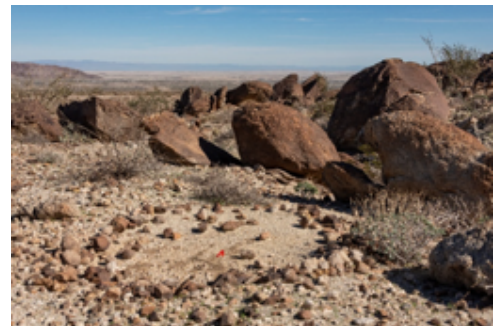
Harper Canyon Survey