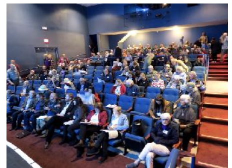
The presentations were held at the Borrego Springs Performing Arts Center.

Chemistry has been a major factor in evaluating the age of items located near these Mammoth remains: from delicate