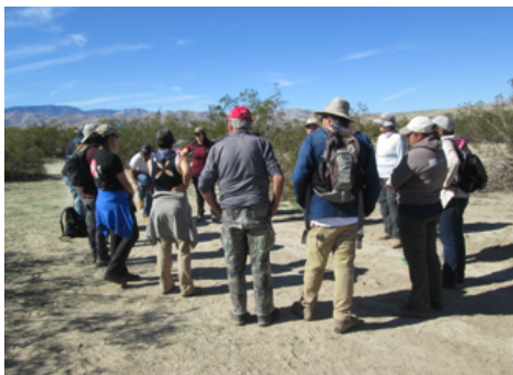
Smudging with sage before surveying

We were able to take the archaeology technician students out on a field trip to Indian Hill as their final class day. They couldn't have been to a better place to celebrate graduating from the program