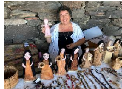
PaiPai artisan from Baja gladly shared her dollmaking techniques with attendees.