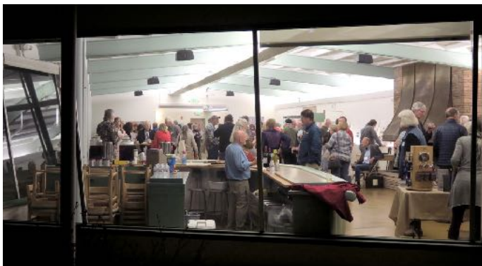
Looking at the crowd from the outside in at the UCI Steele/Burnand Anza Borrego Desert Research Center