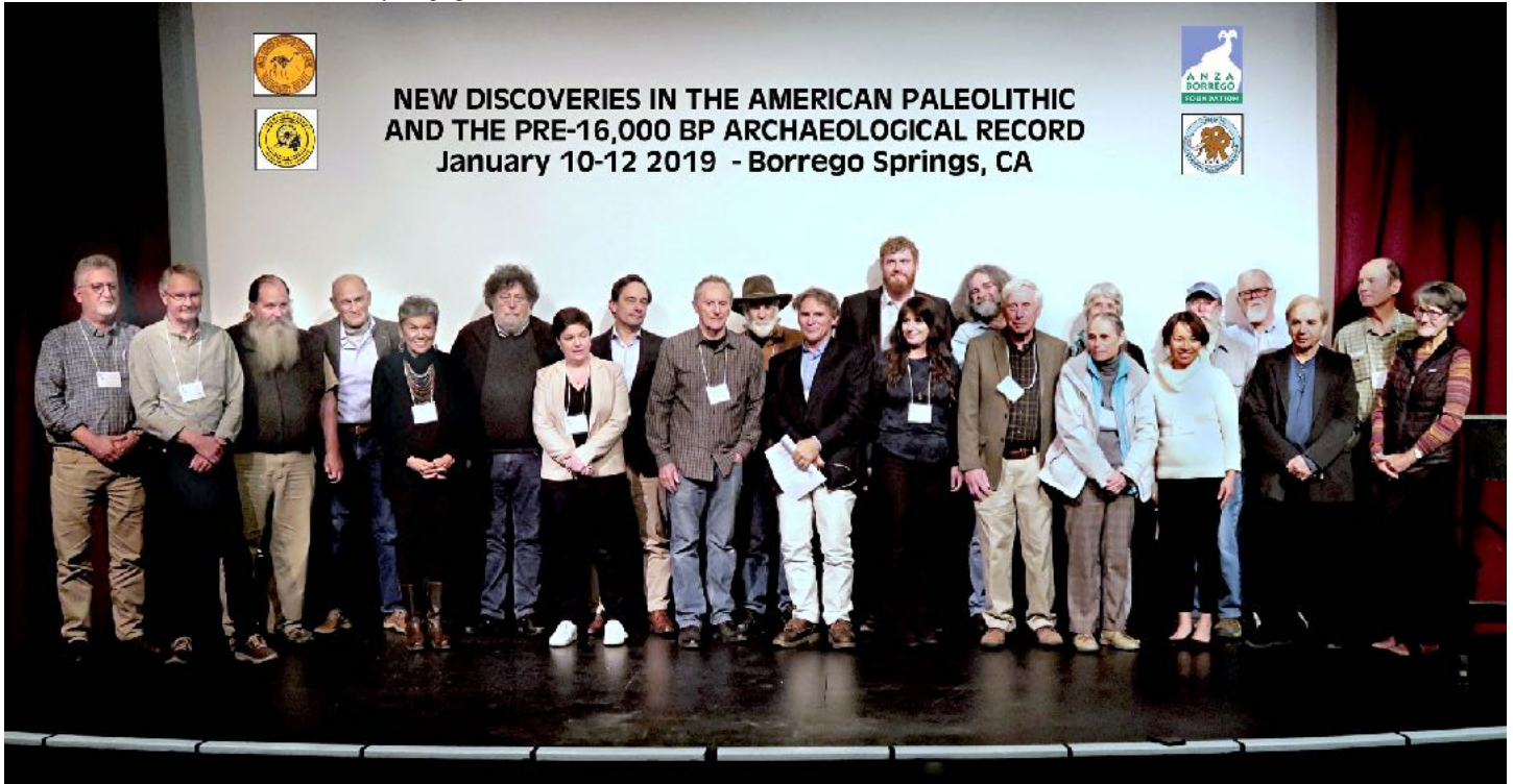
The distinguished presenters at the New Discoveries in the American Paleolithic conference

several other archaeologists from the Southern Service Center, and the help of our volunteers, we were able to eke out almost 50 acres. The ground was absolutely littered with artifacts, and locating and recording the groups and individual artifacts took so much time. You all know how time consuming that can be! We will re-visit the sites in the future for another survey.