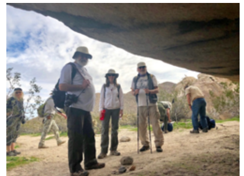
Archaeology technician students at Indian Hill rock shelter