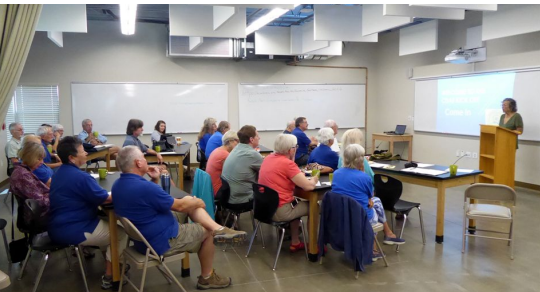
More than 30 CDAS members attended the kick-off meeting at the UCI Steele/Burnand Research Center.