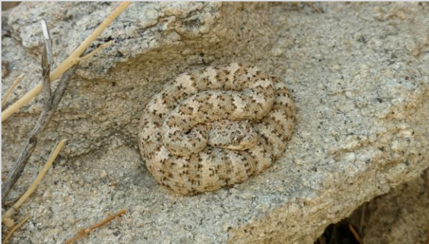
Crotalus mitchellii neonate, a speckled rattlesnake. Don Endicott's idea of fun on a site steward visit.