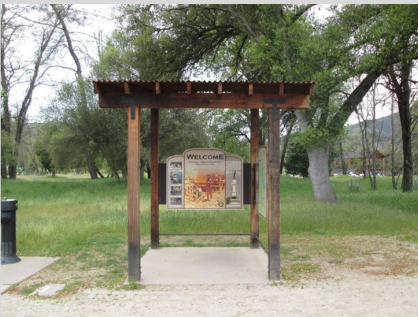
Welcome to the Marshall Gold Discovery State Historic Site near Folsom, Ca.