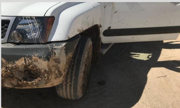
Site Stewardship can be a dirty business