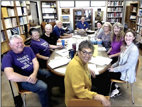
Your Steering Committee at work