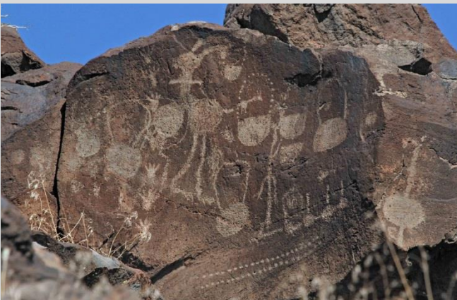
Little Petroglyph Canyon in the Coso mountains.