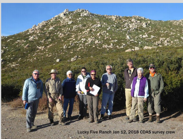
Lucky Five Ranch Jan 12, 2018 CDAS survey crew