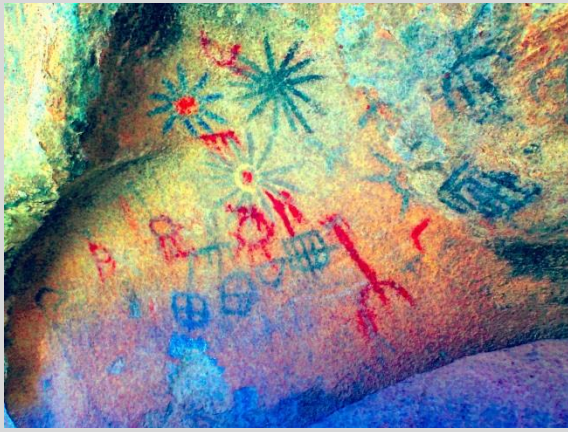
D-Stretch photo of the beautiful panel

After a short drive on dirt roads to the parking area, Robin reviewed the site steward guidelines with the group. Then it was off on a moderate hike to the large rock shelter. Susan Gilliland presented a comprehensive overview of the previous excavations that had been done in the shelter included artifact dating showing an occupation period back approximately 4500 years.