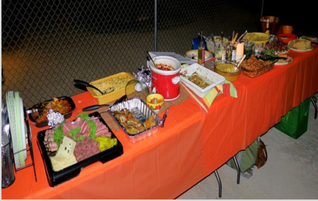
The food was the fabulous!